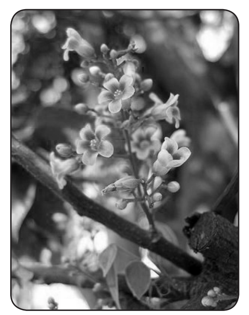
Spiritual significance of the flower: Organized teamwork

In future, do we see a similar possibility of succession planning in business organizations too?