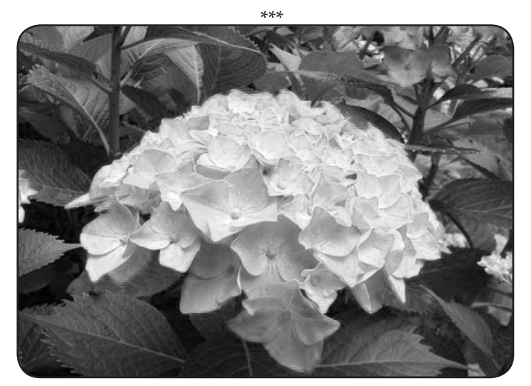
Spiritual significance of the flower: Collective Harmony